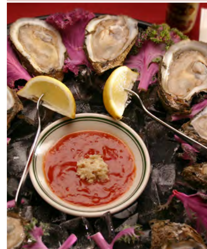
Raw oysters are a popular choice at Little River Inn.

Presented by the Iberia Preservation Alliance, this festival celebrates James Lee Burke's Detective Dave Robicheaux's hometown with bus and boat tours, film viewings, storytelling and publishing workshops, a UL Lafayette Symposium, crime fiction panel discussion, bourée lessons, a 5K run and celebration of great southern writers like Ernest Gaines. For more information, visit TecheFest.com .