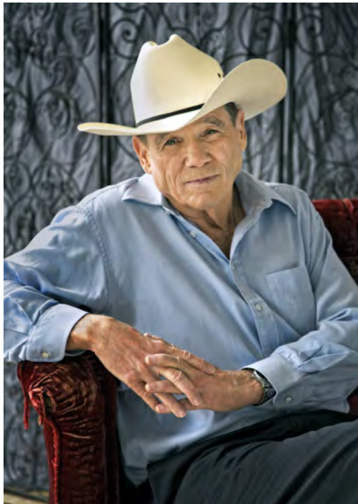
Simon & Schuster

New York Times bestselling author James Lee Burke spent his summers growing up in New Iberia. His literary detective Dave Robicheaux visits many locations in Iberia Parish— from Main Street to the plantations of Jeanerette and coast of Cypremort Point. The Books Along the Teche Literary Festival celebrates New Iberia, the hometown of Burke's famous character Dave Robicheaux, each spring. Visitors can take a self-guided tour to some of Dave's haunts and locations mentioned in Burke's novels. Visit IberiaTravel.com/James-Lee-Burke to download a map or pick one up at Iberia Parish Welcome Center.