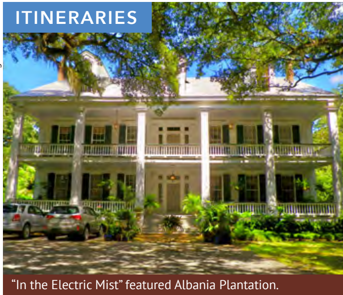
"In the Electric Mist" featured Albania Plantation.