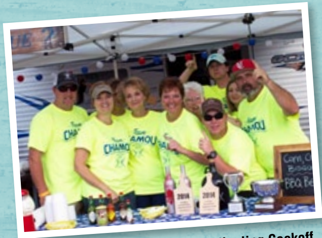
St. Joseph's Catholic Church Tailgating Cookoff Every October